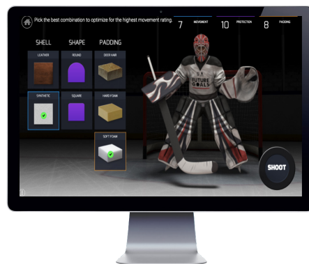
Optimizing Material for Goalie Leg Pads Criteria