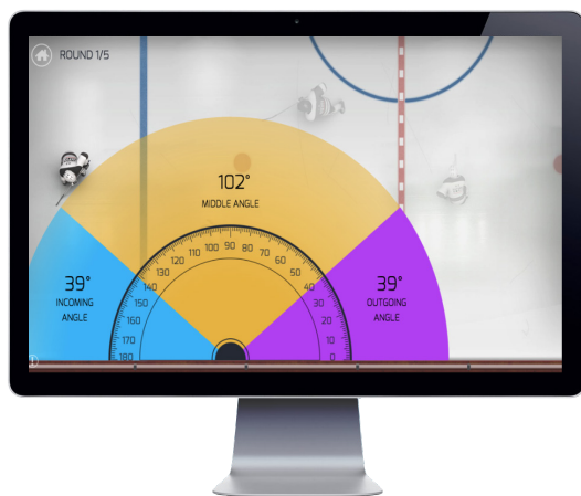
Understanding Angles To Complete A Bank Pass

Geometric Constructions On Ice - Geometry exists everywhere, even on a hockey rink. In this module, students must use their understanding of geometry and the coordinate plane to correctly place the points, line segments, and circles on the hockey rink.